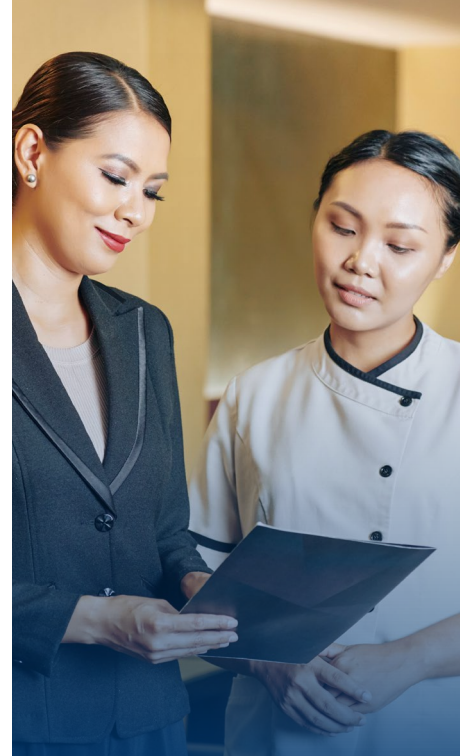
Active Hospitality Apprentices, Fiscal Years 2013–2021

Employers in the hospitality industry across the U.S. and among our global competitors use the Registered Apprenticeship training model to recruit, train, and retain workers with the right skills. Registered Apprenticeship has been the most effective training model for enhancing business performance and competitiveness.