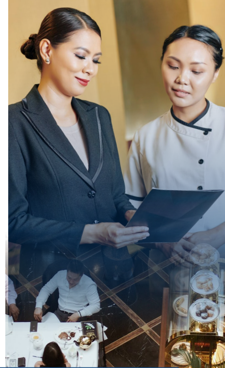
Active Hospitality Apprentices, Fiscal Years 2013–2021

Employers in the hospitality industry across the U.S. and among our global competitors use the Registered Apprenticeship training model to recruit, train, and retain workers with the right skills. Registered Apprenticeship has been the most effective training model for enhancing business performance and competitiveness.