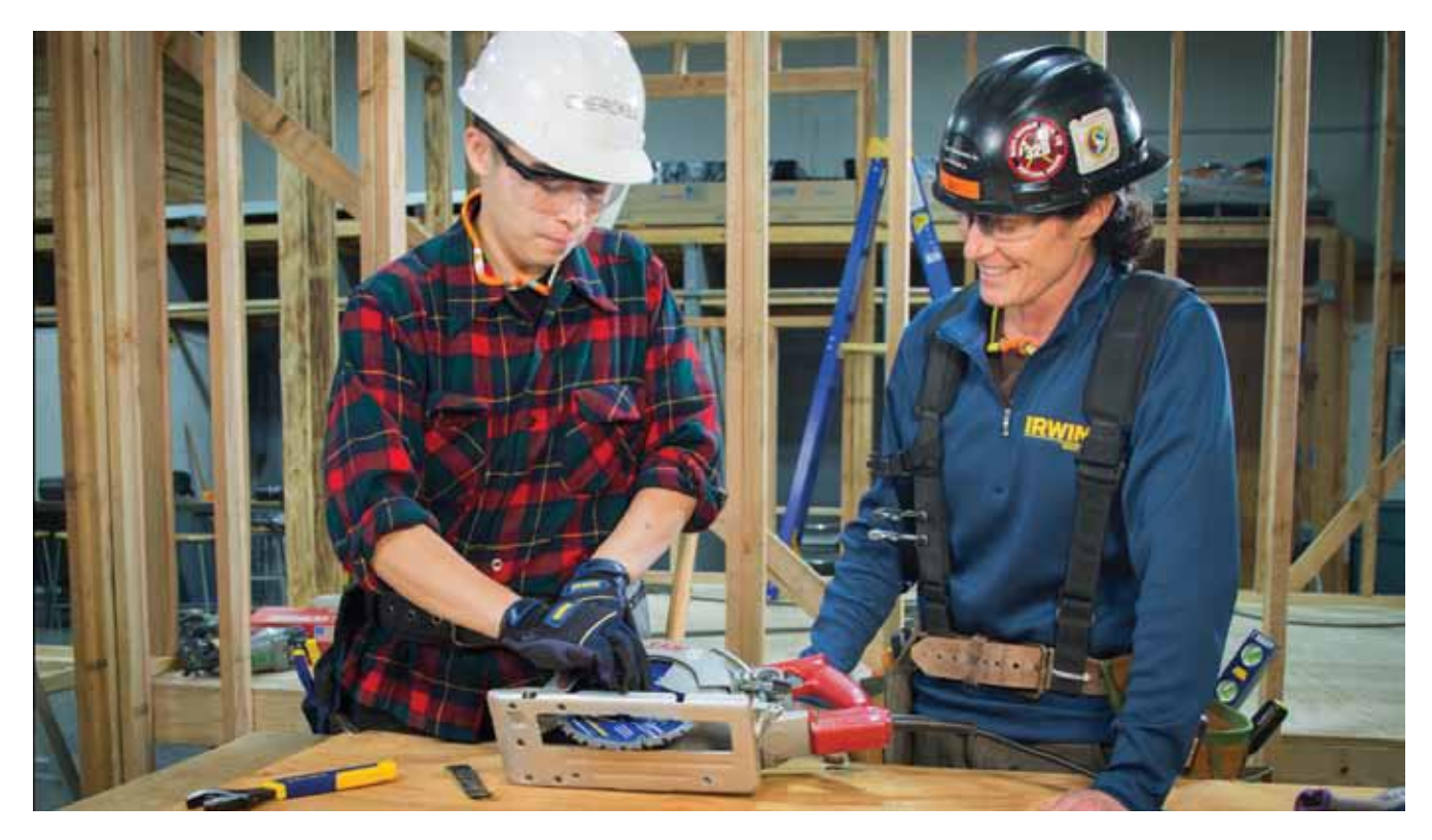
Female instructors provide role models for women in the trades.

challenges as a result of having a low income- 80 percent of NEW students, for example, fall into that category, and a third are single mothers.<sup>24</sup> Graduation rates for CWIT and NEW average around 70 percent, and are comparable with community based programs serving similar populations.<sup>25</sup> OT's graduation rates are a little higher, over 85 percent, which may be due to the fact that OT's students on average are a little older than students in the other programs.