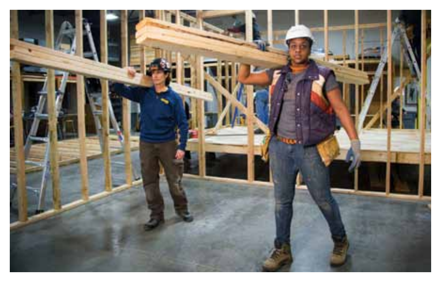
Learning how to lift in a safe manner is part of all programs.

This briefing paper profiles three women-only pre-apprenticeship programs<sup>7</sup> – <u>Chicago Women in the Trades</u> (CWIT), New York's <u>Nontraditional Employment for Women</u> (NEW), and <u>Oregon Tradeswomen Inc.</u> (OT) that are achieving impressive results