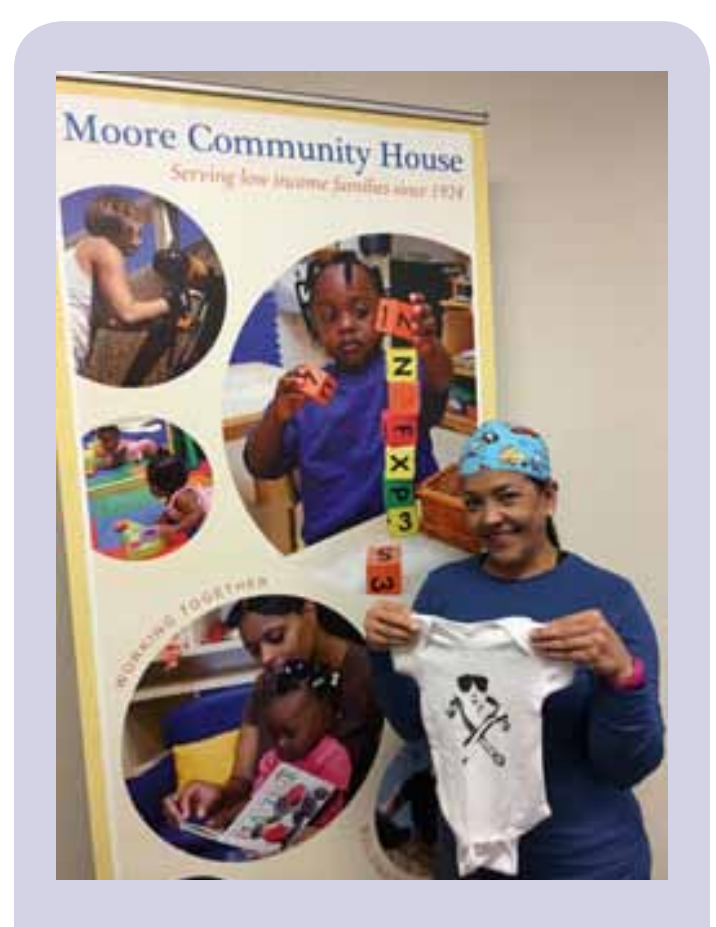
You can never start outreach early enough: A WinC student is investing in WinC wear for her granddaughter, whose mother, too, is a WinC graduate.

"We offer pathways to well- paid jobs in manufacturing and construction. Child care makes that opportunity available to women who otherwise would not be able to take advantage of these opportunities."