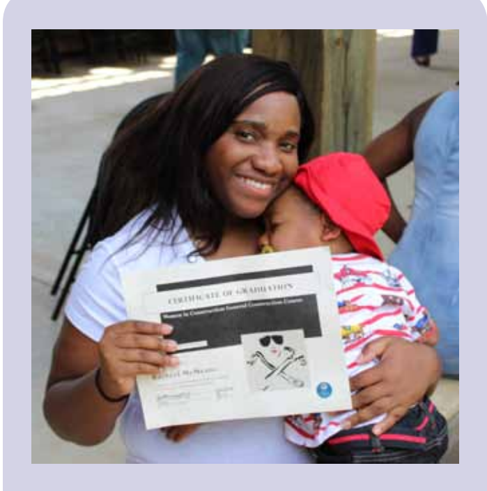
The participation of mothers of young children has increased dramatically in WinC programs since comprehensive child care supports have become available.

Step Up for Women program participants spend two thirds of their time on technical skills, and one third on work readiness. Instruction takes place at RCBI centers, which are set up for providing exposure to different manufacturing equipment and production processes. Women learn the basics of operating lathes and mills, setting up CNC machines, and inspection and quality