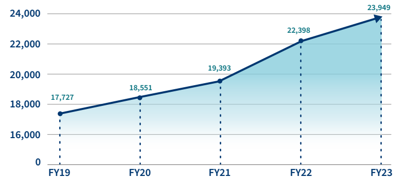
Total Energy Apprentices Served, Fiscal Years 2019–2023

In 2023, there were 23,949 Apprentices Served in the energy industry